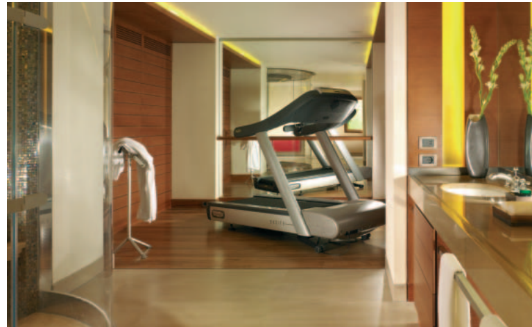
AMBASSADOR VILLA Sea view with private pool