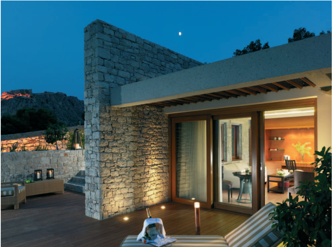
EXECUTIVE VILLA Sea view with private pool