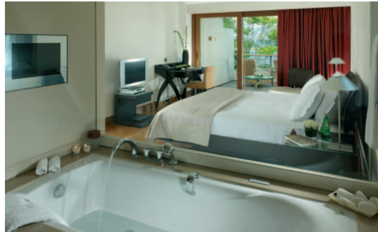
LUXURY VILLA Sea view with private outdoor Jacuzzi