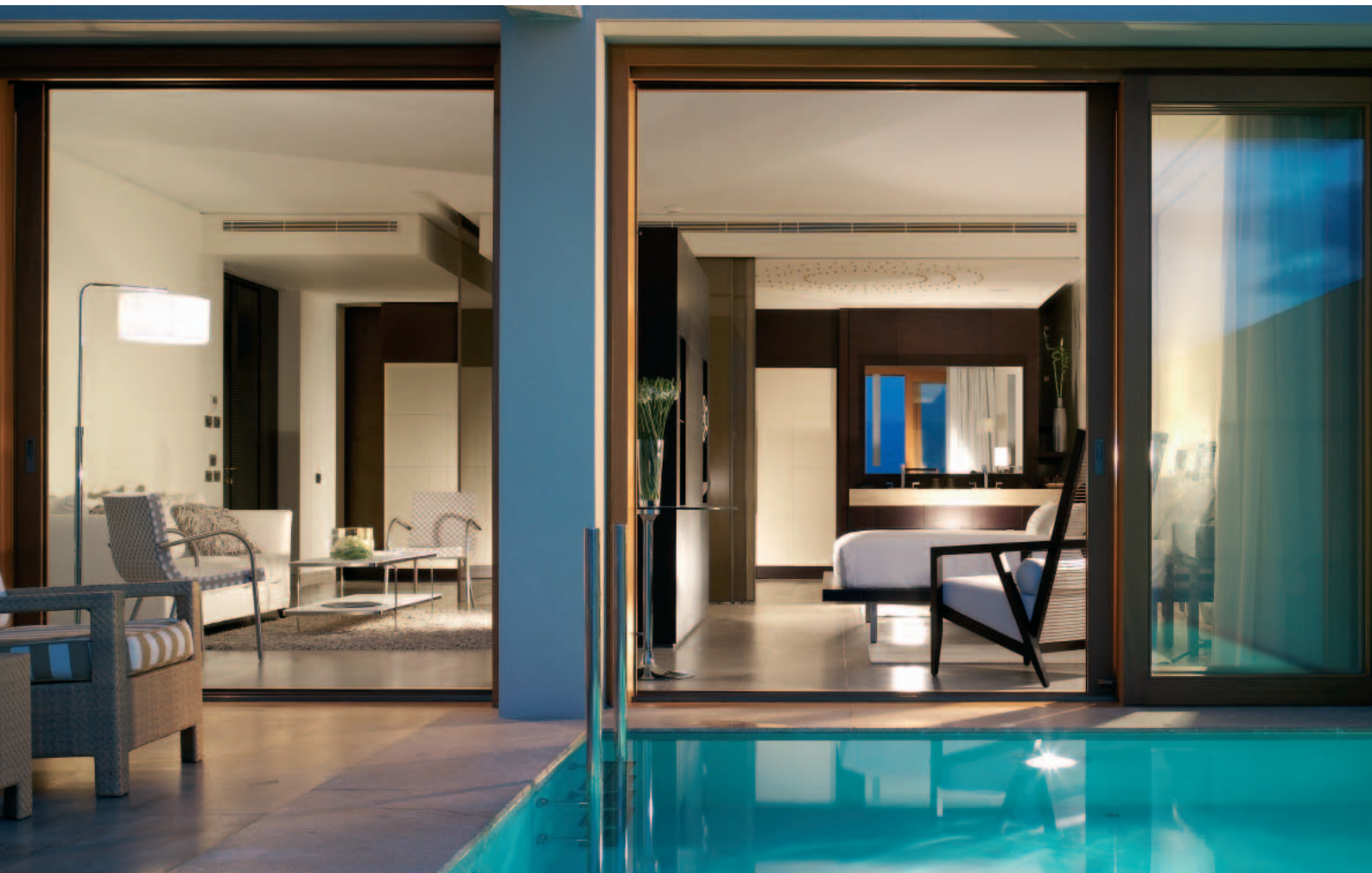
AMBASSADOR VILLA Sea view with private pool