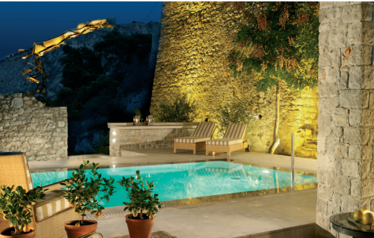
AMBASSADOR VILLA Sea view with private pool