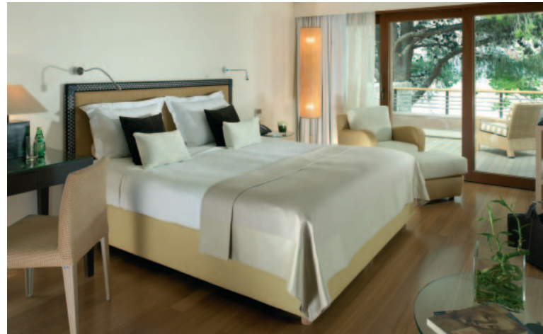
EXECUTIVE VILLA Sea view